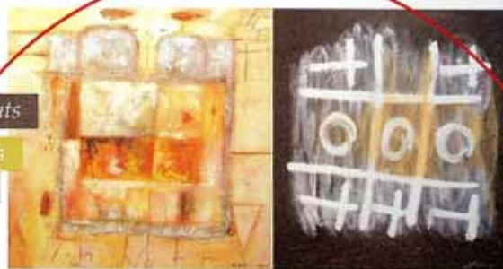
Pink Spice (left) and Noughts And Crosses , $350 each for 90cm x 90cm, with larger sizes available.

Imagine a book so incredibly beautiful you feel inspired every time you flip through it. Collaborations with Alexander McQueen and Swarovski have kept Dutch designer Tord Boontje at the cutting edge of visual art, and he has now released a book full of his amazing work. You'll find yourself referring to it a hundred times over. Tord Boontje , $130 (Hardie Grant).